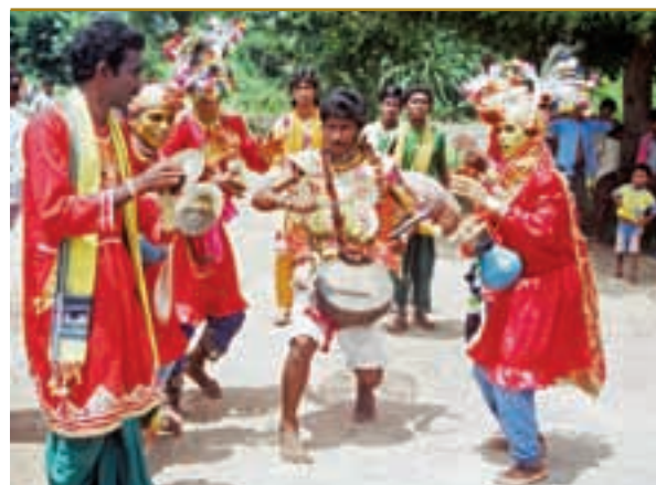
Kalajatha programmes are used to spread messages

A range of different mechanisms have been adopted to share lessons. These include the stakeholder Livelihoods Forum in Madhya Pradesh, independent impact assessments, research and documentation and annual experience sharing events across programmes. There is a strong emphasis on piloting, demonstrating and learning from new approaches, sharing these with government departments and working to ensure that they are mainstreamed within long-term schemes and programmes of the relevant line departments.